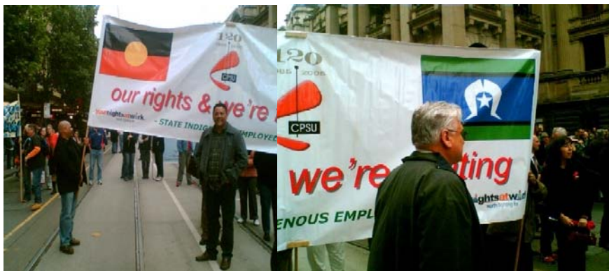
CPSU Indigenous Banner

The IBS also hopes to further expose public servants to the branch section, promote union benefits and increase membership through the production of small flags and stickers and through developing a cultural awareness presentation for employees in the Victorian Public Service.